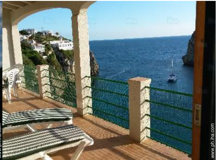
view from the covered terrace