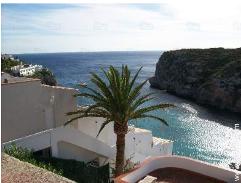
view over the sea