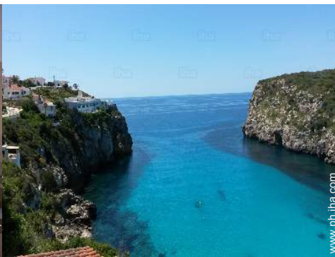
view over the sea