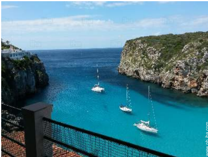
view over the sea