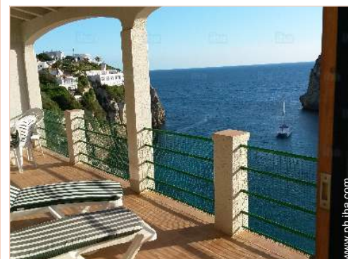
view from the covered terrace