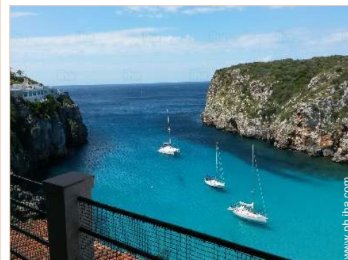
view over the sea

Village center 800m Bus stop / bus station 500m Car rental 500m Local stores 500m Supermarket 500m Hairdressing salon 500m Internet cafe 500m Mail office 800m Bank 800m ATM 500m Drugstore 800m Doctor 800m Hospital 15km