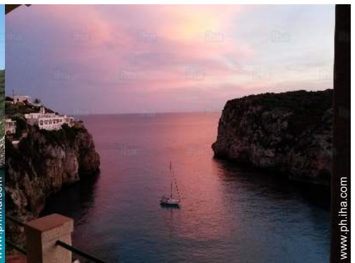
view of the sunset