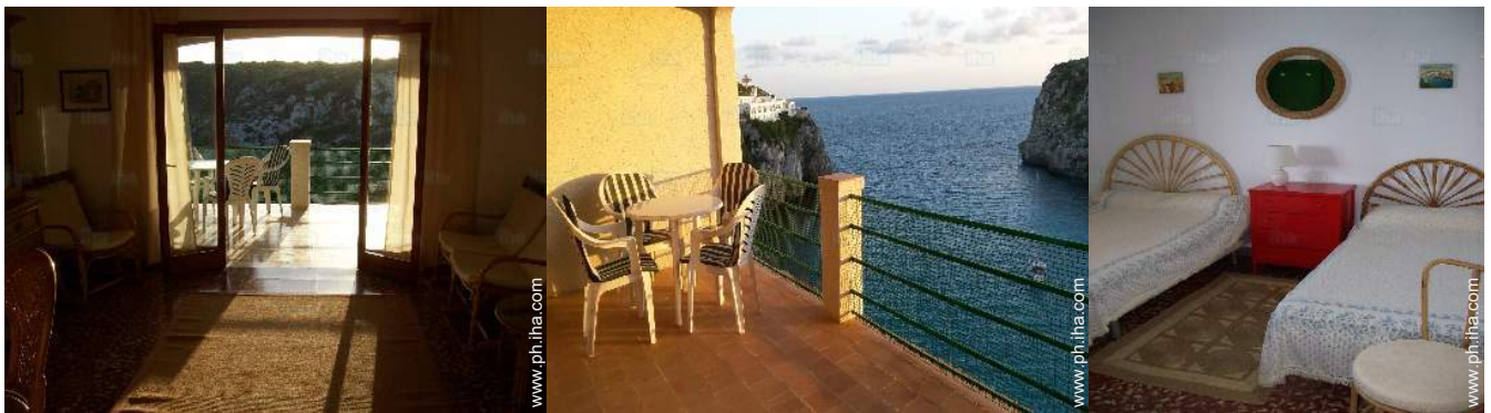
view from the living room