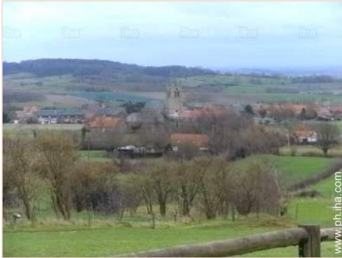
view of the village