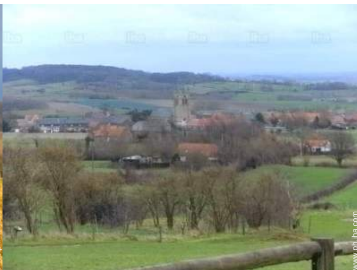
view of the village