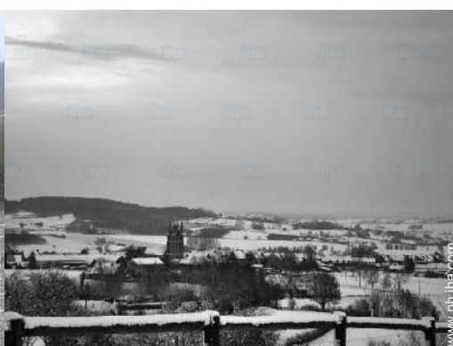
view of the village center