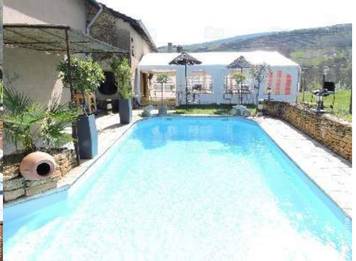
private swimming pool