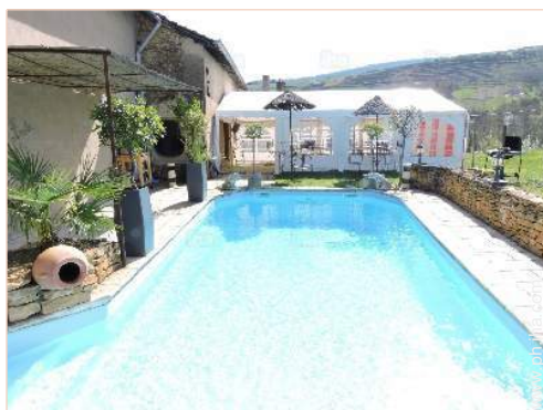
private swimming pool