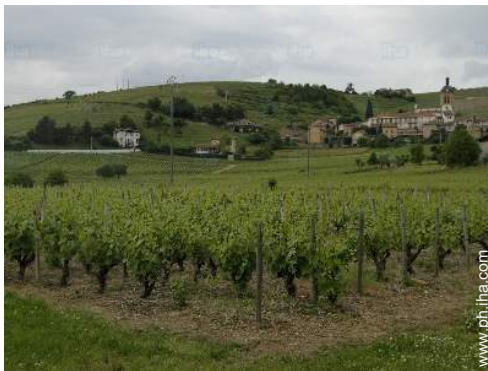
view over vineyard