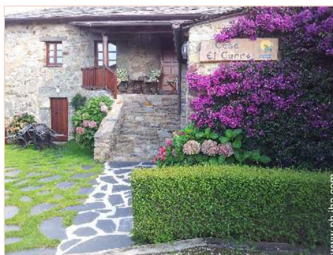
Single family home