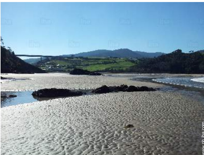
view over the sea