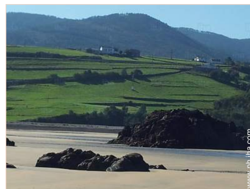
view over the sea