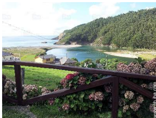
view from the garden/park