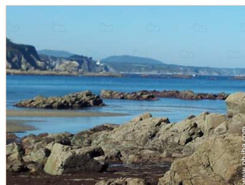
view over the sea

Village center 100m Bus stop / bus station 1km Scuba diving material hire 3km Household linens for hire/laundry services 1,5km Breadstore 3km Local stores 3km Supermarket 3km Hairdressing salon 3km Mail office 3km Bank 3km ATM 3km Drugstore 3km Doctor 3km Nurse 3km Hospital 15km