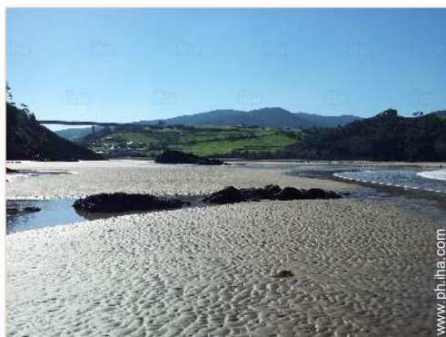
view over the sea