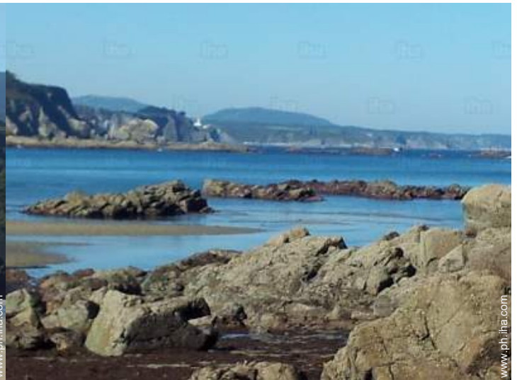
view over the sea