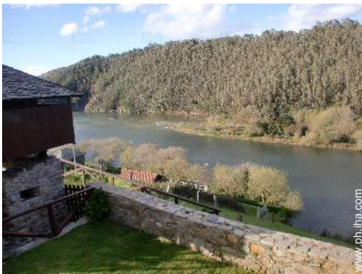
view over the river