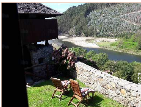
view from the garden/park