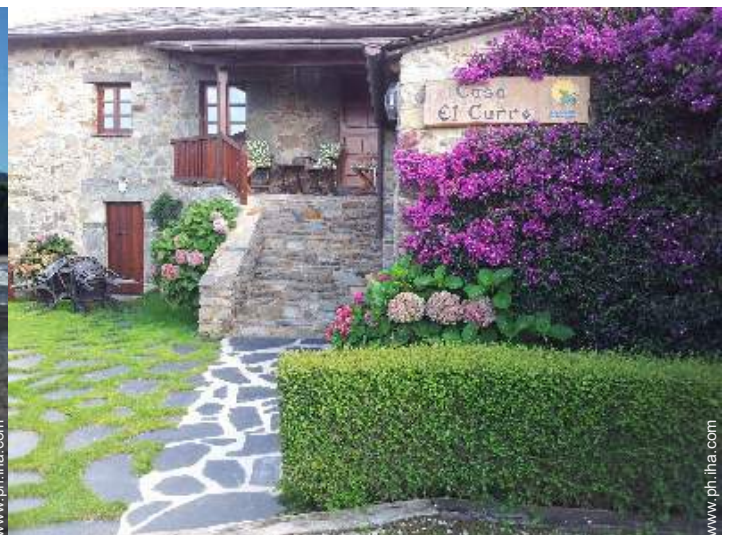
Single family home