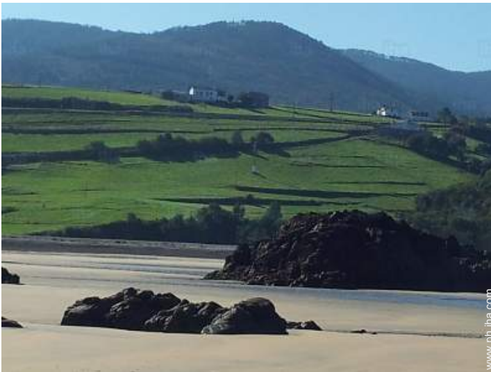
view over the sea