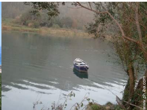
view over the river