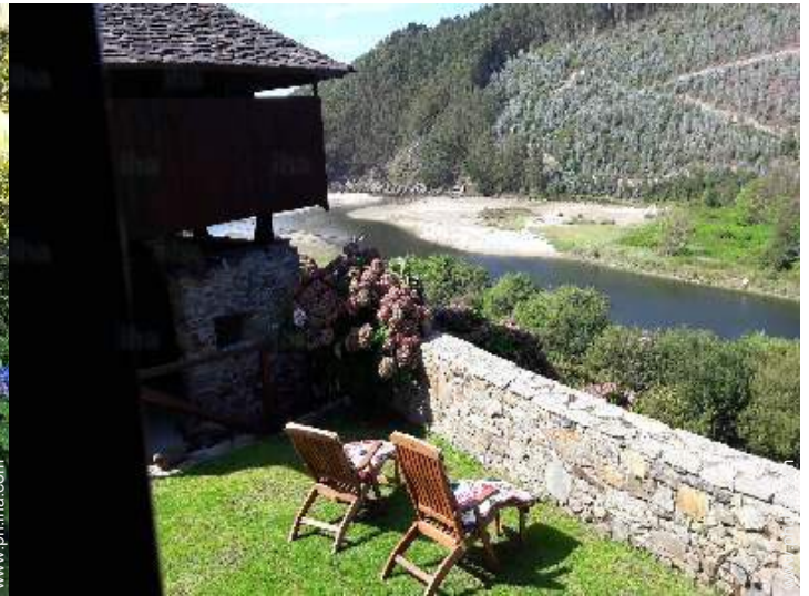
view from the garden/park