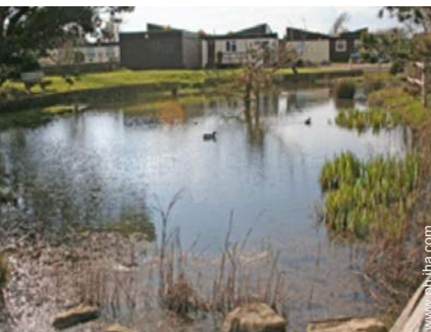
view over the countryside