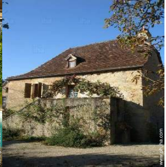
Charming Typical House