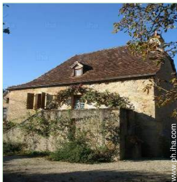
Charming Typical House