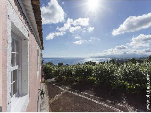
Single family home