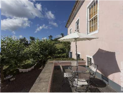
Single family home