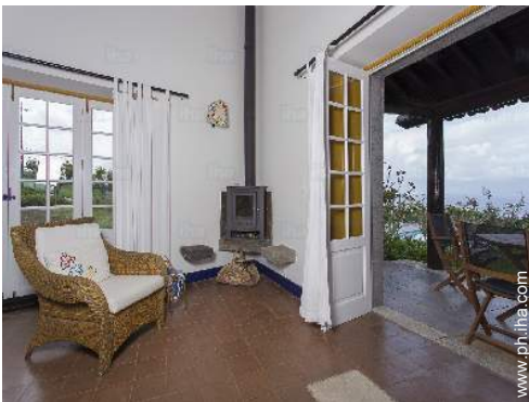
view from the living room