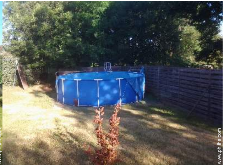
Round swimming pool