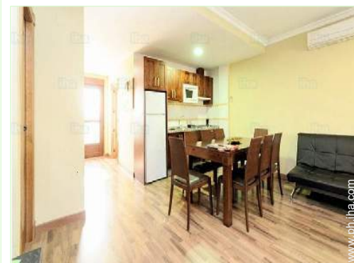
Guest facilities and furnishings