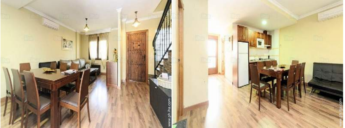
Guest facilities and furnishings