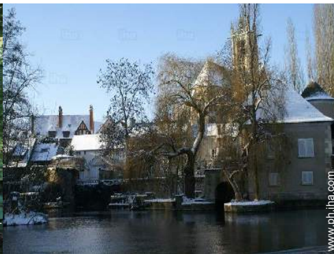
general floor plan