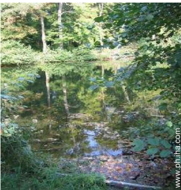
view over the river