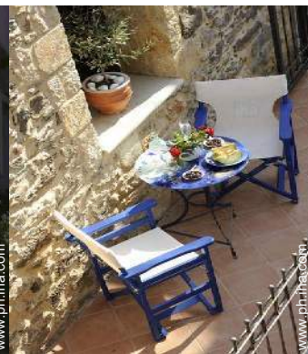
Exterior amenities at guests disposal