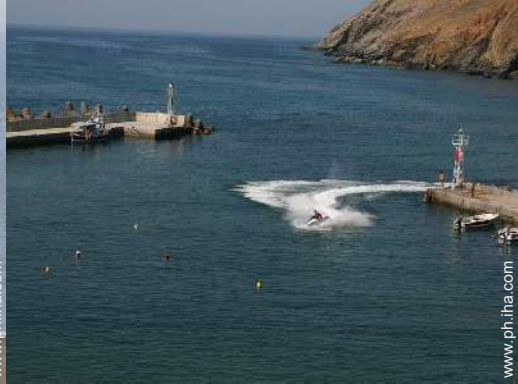
summer sports nearby