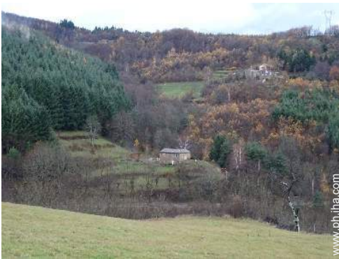
view from the house