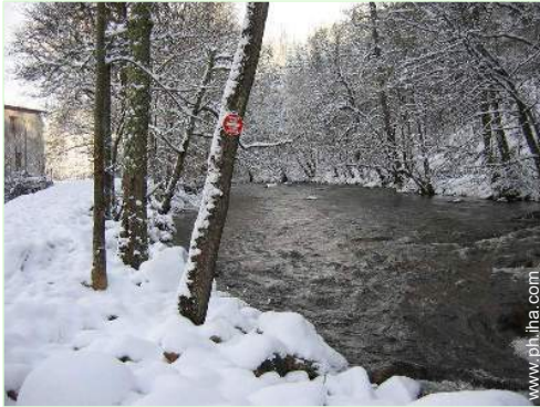
view over the river