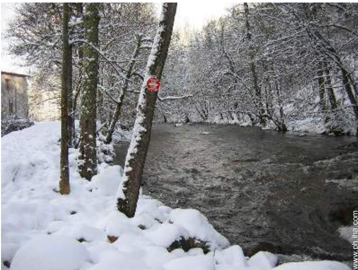
view over the river