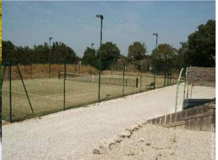
Tennis - grass