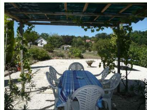
view from the garden/park

Village center 500m Car rental 20km Breadstore 500m Caterer 500m Local stores 500m Supermarket 15km Hairdressing salon 500m Mail office 500m Bank 500m ATM 500m Drugstore 800m Doctor 800m