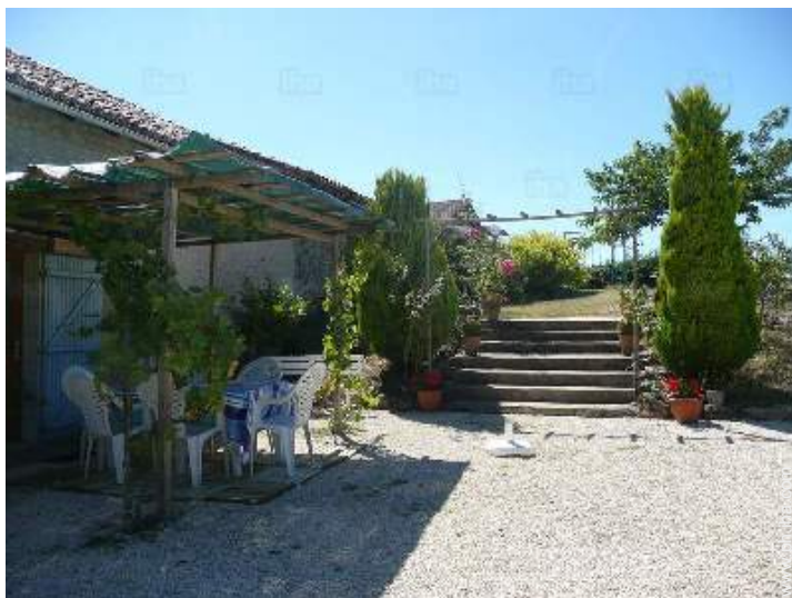
view from the terrace