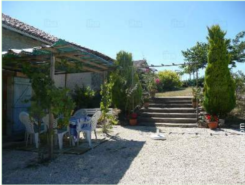
view from the terrace