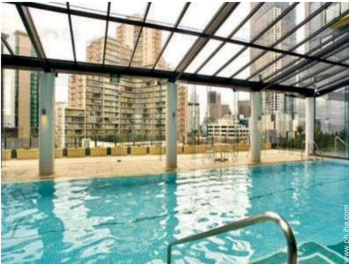
Heated swimming pool