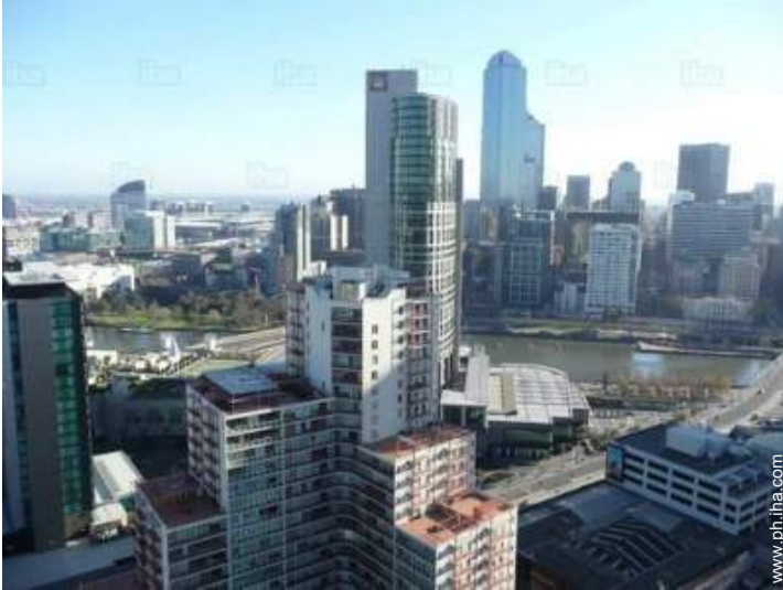
view over the river