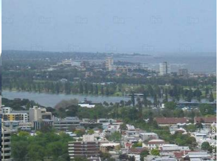
view over the lake