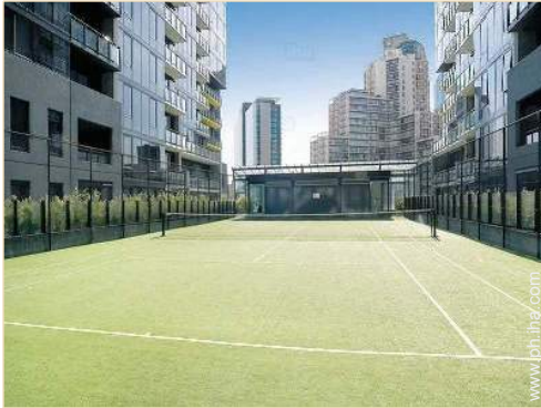
Tennis - synthetic surface