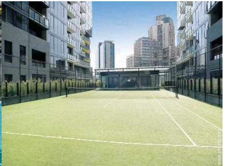
Tennis - synthetic surface