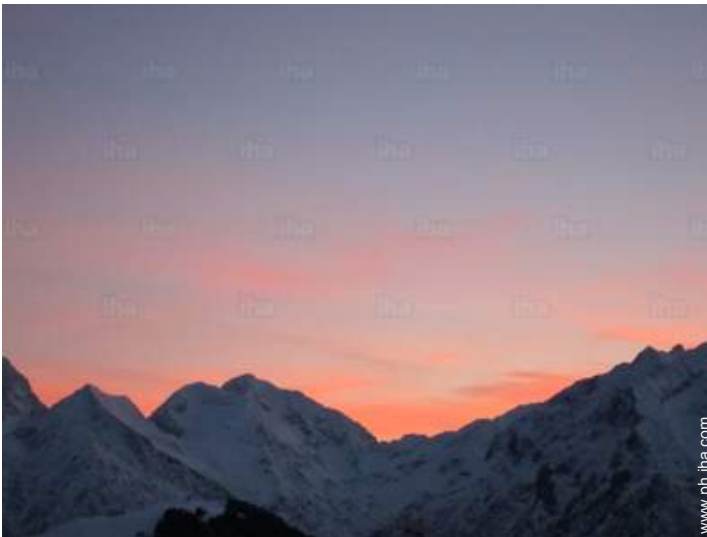
view from the apartment