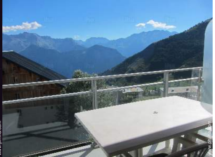
view from the apartment