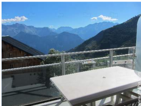
view from the apartment