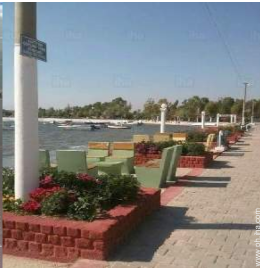
view of the port