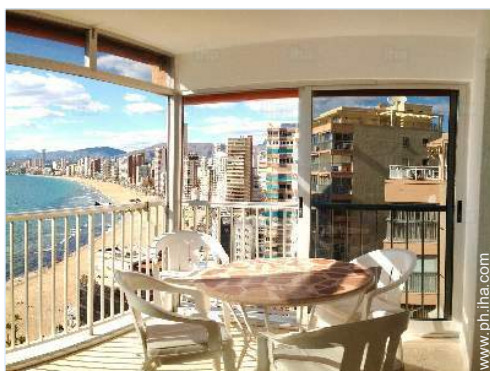
view from the apartment