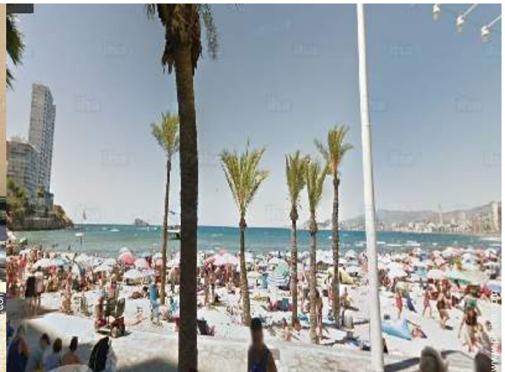
flying pursuits nearby