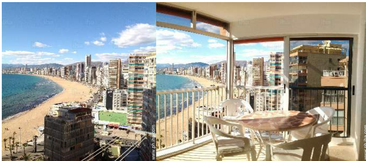
view from the apartment