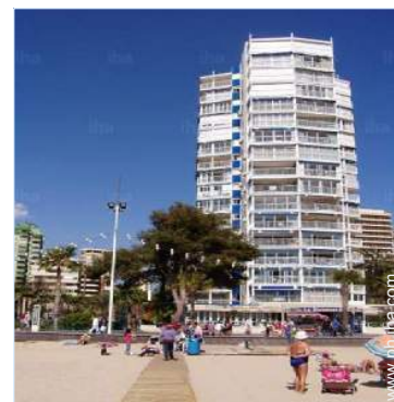
the apartment house/building

Village center 1,5km Downtown <50m Bus stop / bus station 100m Breadstore 50m Local stores <50m Supermarket 200m Hairdressing salon 200m Mail office 300m Bank 200m ATM 100m Drugstore 300m Doctor 500m Hospital 1,5km