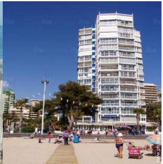
the apartment house/building