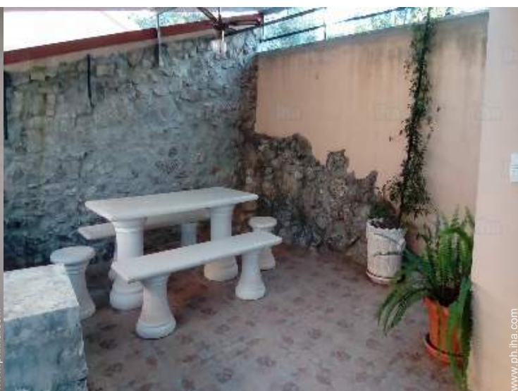
summer living area