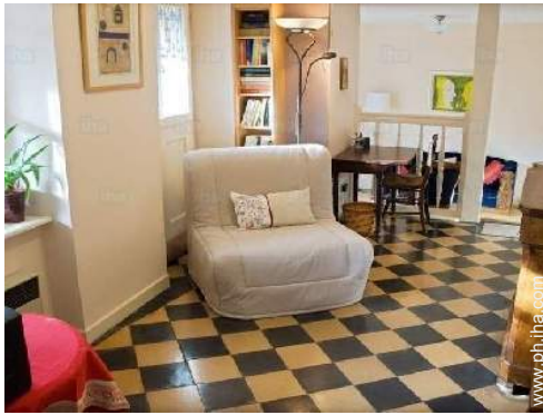
sleeper sofa(s) 1 pers