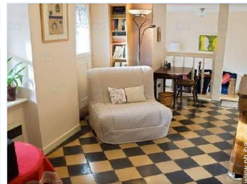
sleeper sofa(s) 1 pers

Yard table(s), 4 yard seat(s), parasol, 2 chaise(s) longue(s)