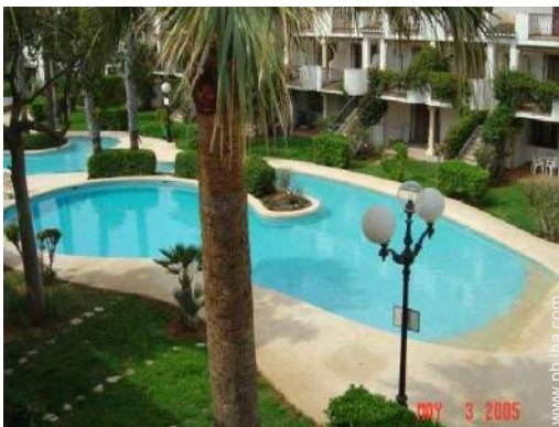
view from the balcony