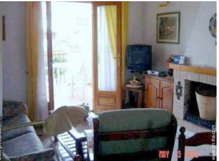
view from the living room