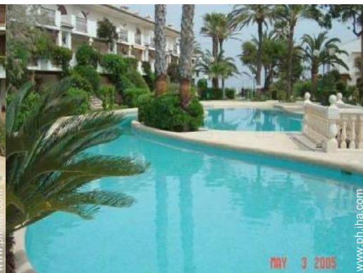
Exterior facilities at guests disposal