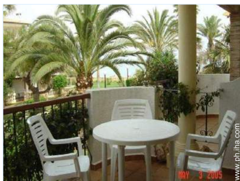
view from the balcony