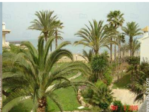
view from the veranda