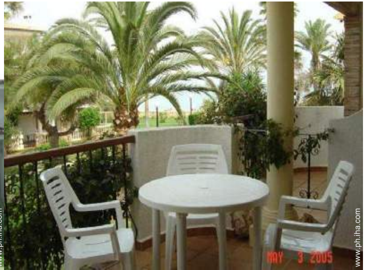
view from the balcony