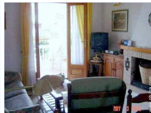
view from the living room