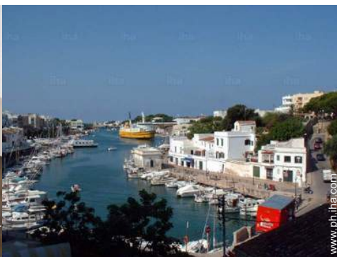
Cities close by