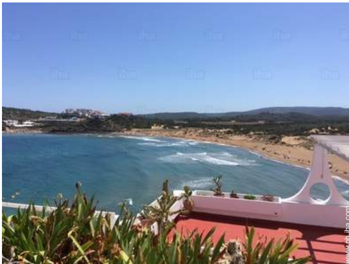
view from the apartment