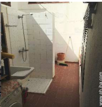
outside shower facilities