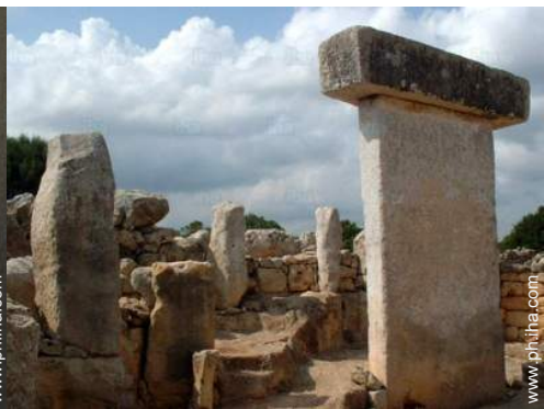
Attractions and relaxation