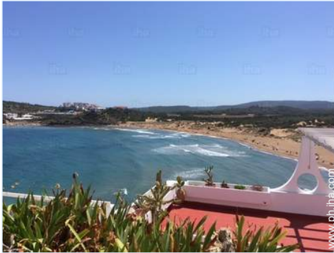
view from the apartment