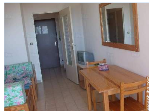
Interior layout and facilities