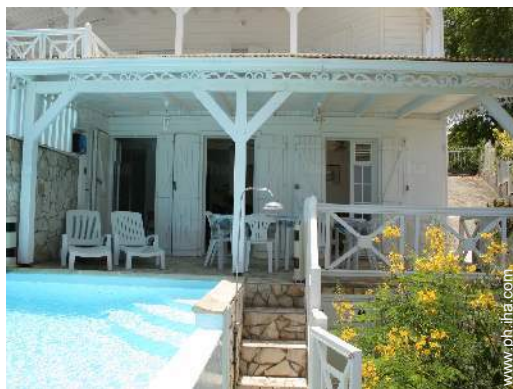
outside shower facilities