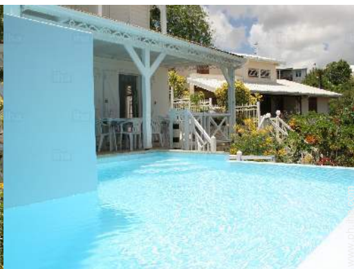
Cascading swimming pool