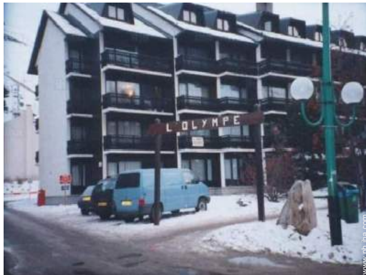
the apartment house/building