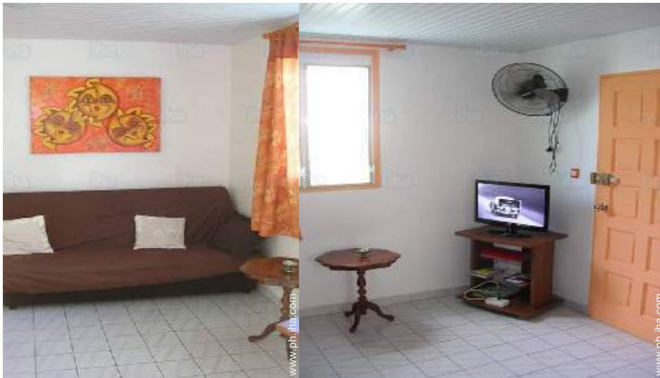
sleeper sofa(s) 2 pers