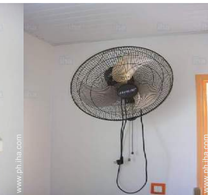
ceiling paddle fan