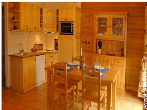
Guest facilities and furnishings