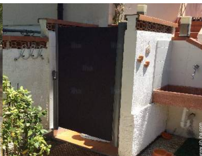
outside shower facilities