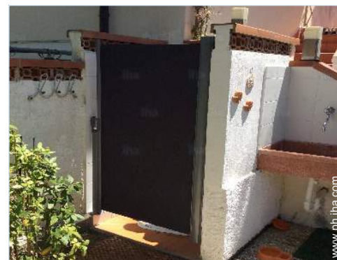
outside shower facilities

Bus stop / bus station 300m Bus pick up point beach 300m Bike/mountain bike hire 1,5km Scooter/motorbike hire 1km Car rental 2km Scuba diving material hire 4km Breadstore 1,5km Local stores 1,5km Supermarket 2km High class retailers 10km Hairdressing salon 2km Internet cafe 5km Mail office 1,5km Bank 1,5km ATM 1,5km Drugstore 1,5km Doctor 4km Hospital 20km Dispensary 5km