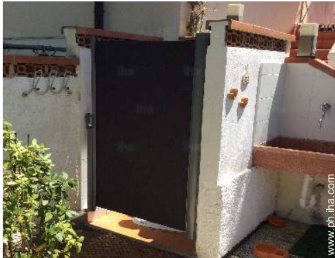
outside shower facilities