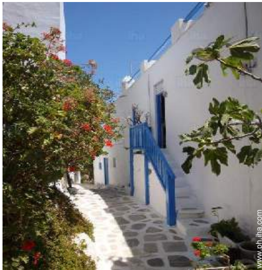
Cycladic style House