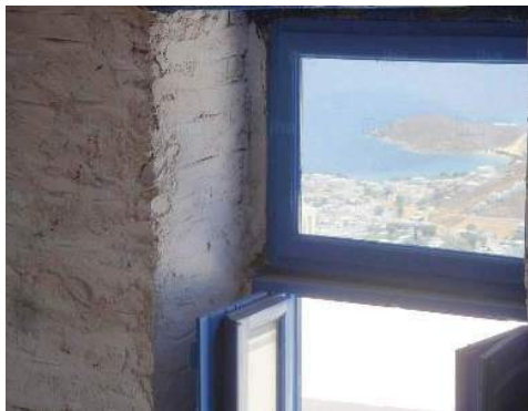
view from the mezzanine