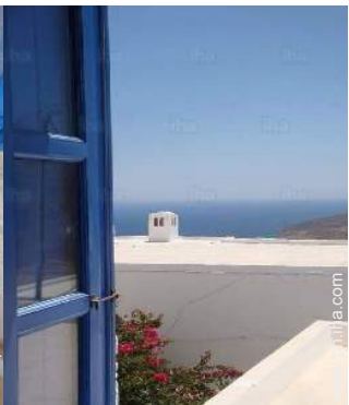
view from the living room