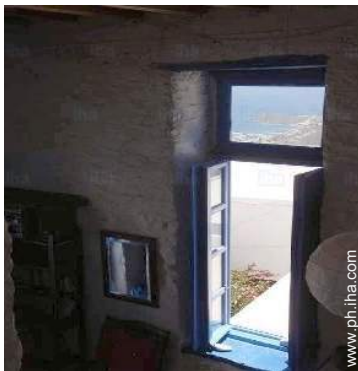
view from the mezzanine