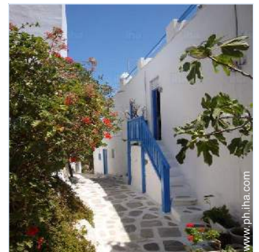
Cycladic style House