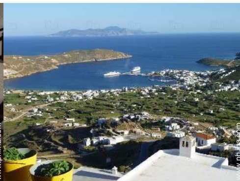
View from the property