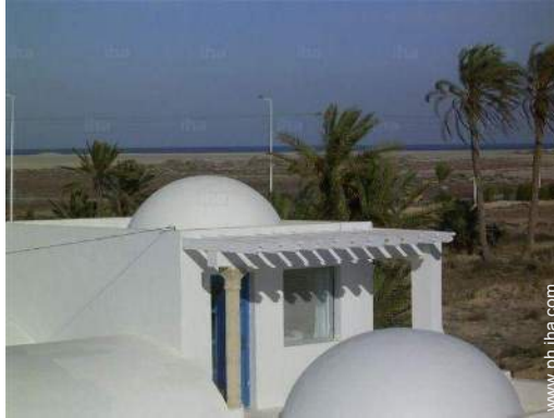
view from the roof terrace