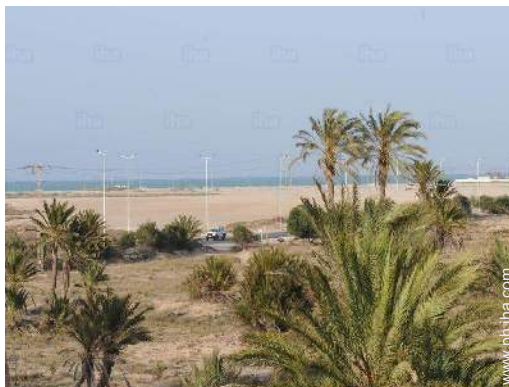
view from the roof terrace