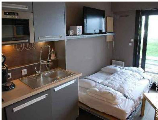
foldaway bed(s) 2 pers