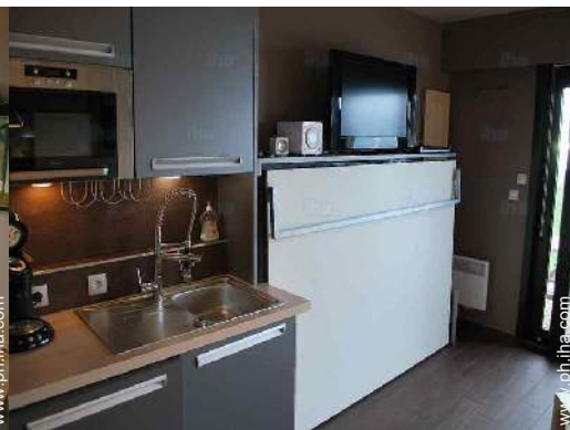
foldaway bed(s) 2 pers