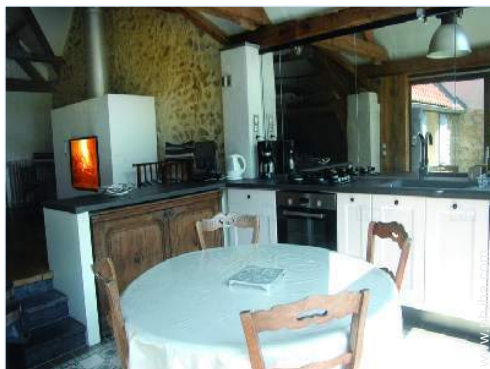
view from the kitchen