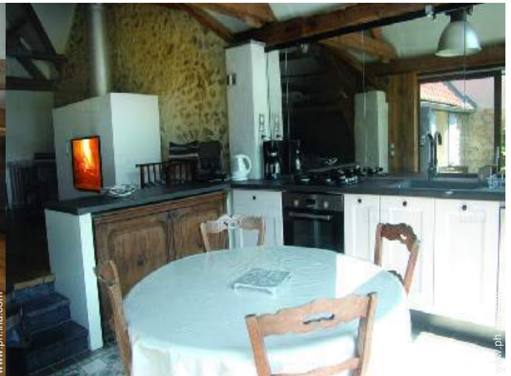
view from the kitchen