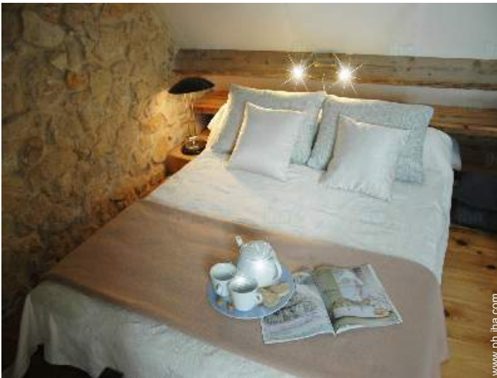
view from the mezzanine