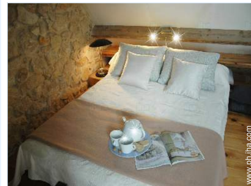
view from the mezzanine

Drugstore 300m Doctor 200m Hospital 10km