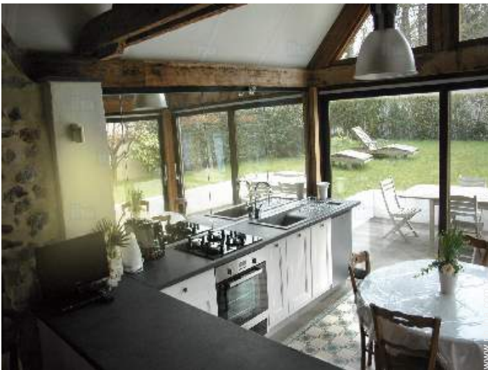
view from the kitchen