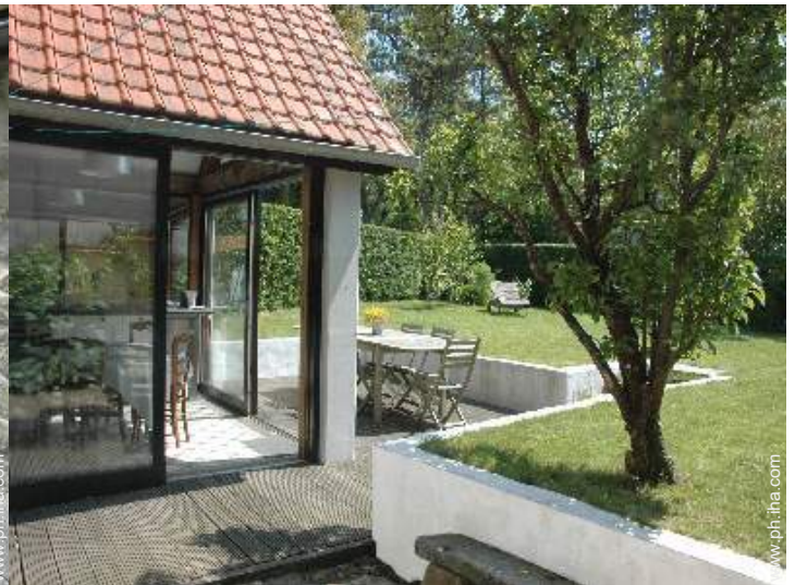
view from the terrace