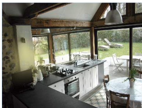
view from the kitchen