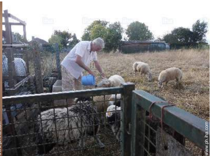
view over farmland