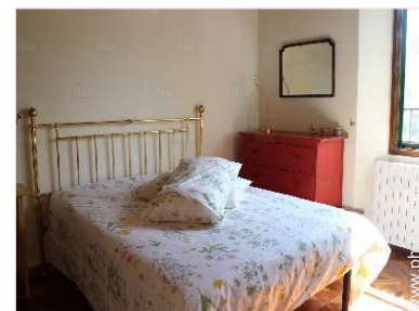
The guest room